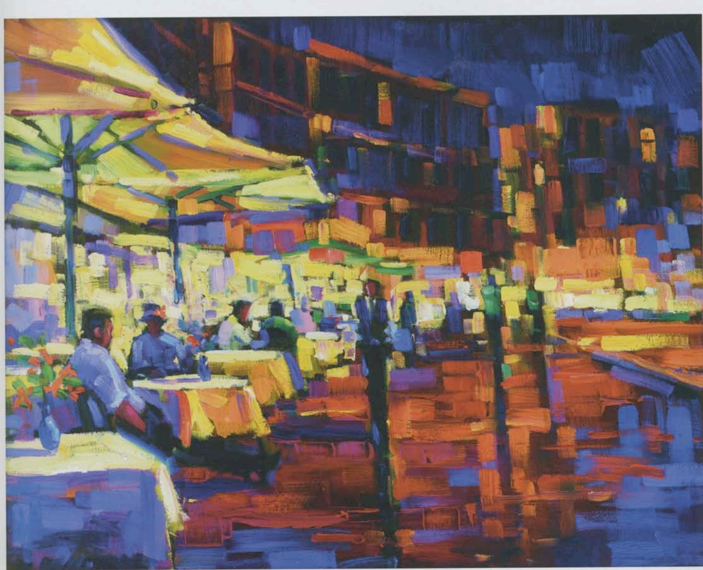
Cappuccino with Friends