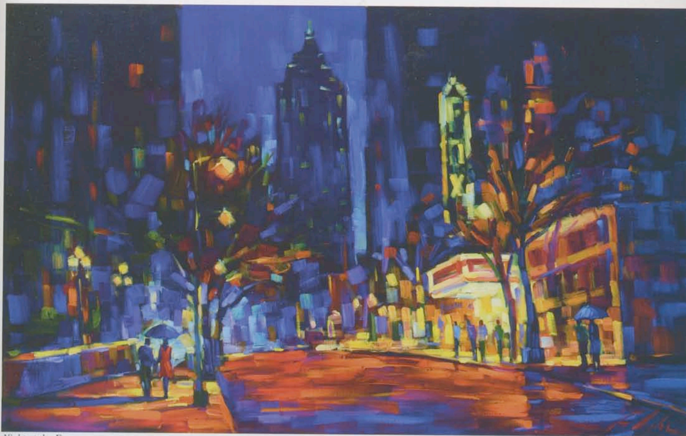
Night at the Fox