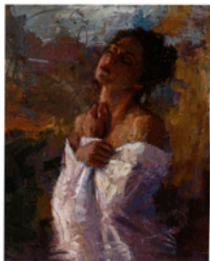
"Bliss," oil on board

My fascination with the human form can be easily felt when viewing my work in person. The colors serve as the rhythm, and texture emulates the unpredictability of the moment. All of this places the human body in the context of being marvelously displayed and yet ordinary in its placement. I am endlessly amazed by the function and the sublime beauty of our bodies. I find it to be the most fascinating subject to paint. The complexity balanced with its suppleness is astonishing. The human figure is the prime example of life because it represents so eloquently the grandiose balance of strength and delicacy, and I have dedicated much of my art to examining it, celebrating it and learning from it.