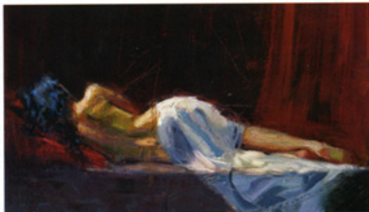
"Quiescence," oil on board

MOST RECENT GALLERY SHOW: Vinings Gallery, Atlanta