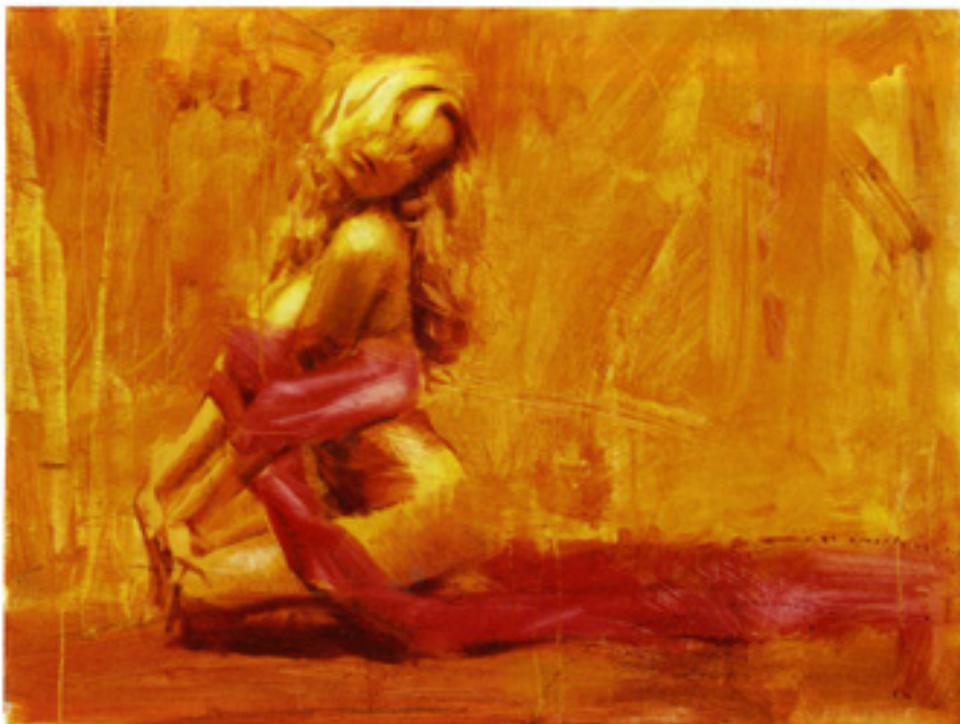
"Golden Aura," oil on board

If anyone were to ever really want to know me as person or how I felt inside, they would need to go no further than the abstraction that makes up my work. The aggressive, textural rivers of colors reveal a lot about myself and how I view the world. I am intense about it. I find it glorious to have been given a chance to live in such a chaotic and beautiful place.